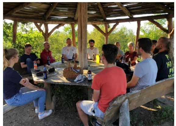
Strategy-Workshop with the entire Team (September)