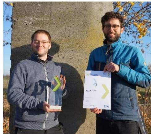
Winning the KfW award for saxony (December)