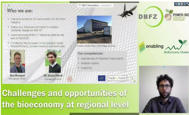
Discussing bioeconomy potentials in Saxony (June)