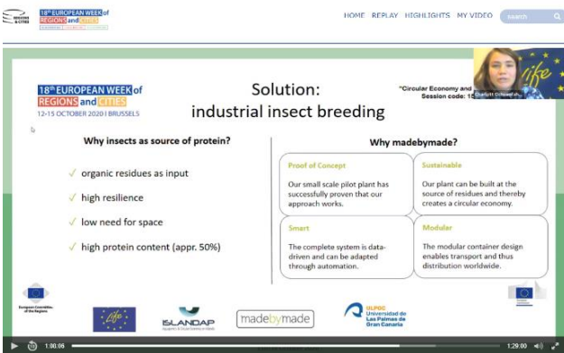
EU Week of City and Regions (October)