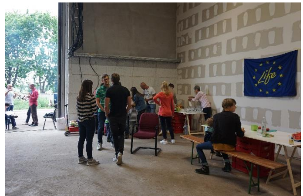
Barbecue at pilot plant with stakeholders (June)